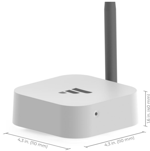
Figure 2: Device Dimensions

The outer dimensions of Finestra Miner are: 4.3 x 4.3 x 1.6 in (110 mm x 110 mm x 40 mm)