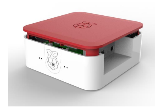
1140 pc per pallet (Full pallets only) - Raspberry Pi – Versions B+ / V2 / V3